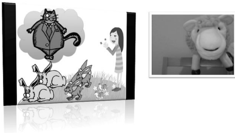
Figure 3 Final image accompanying the puppet's utterance of the test sentence Lucy was allowed to hold any rabbit.

See (46) for an example test item and Figure 3 for the accompanying final image.