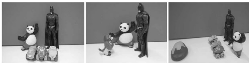
Figure 1 A free choice disjunction trial.